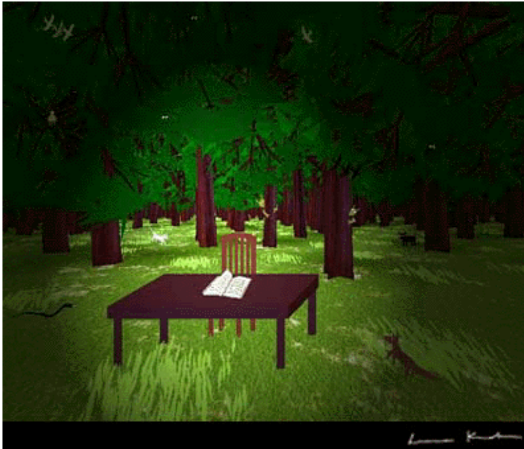
Aukio, by Leena Krohn 24